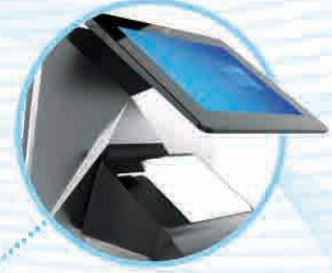
VFD / 10" / 15" Customer Display