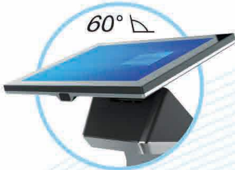
60 Degree Tilt Adjustment