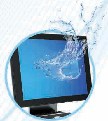
IP54 Whole Unit

point of sale system · security system · business intelligence