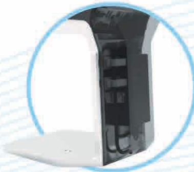
Internal Power Supply Cable Management System