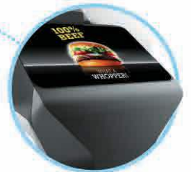
7" LCD / Customised Logo