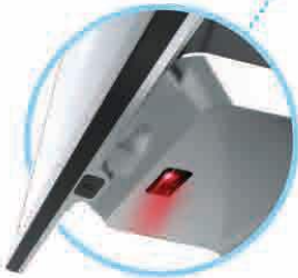
Integrated 1D Barcode Scanner