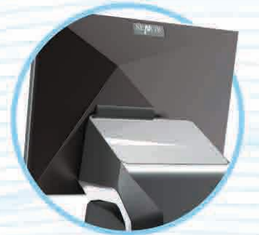
Fanless / Ventless / Screwless