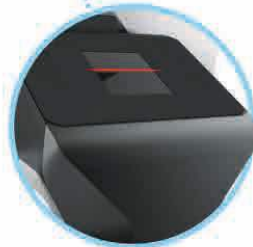
2D Barcode Scanner / RFID (NFC)