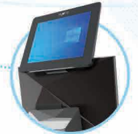
Upward Facing Display