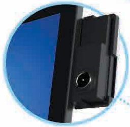
MSR / Fingerprint / RFID Reader